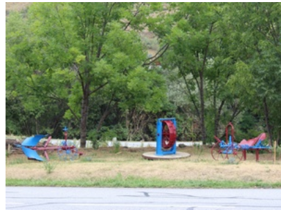
Area at the entrance of Rô coming from Saillagouse