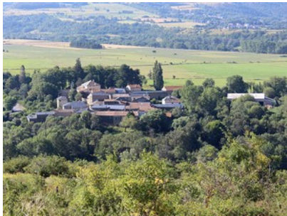
General view of Rô in summer from the railway station of Estavar