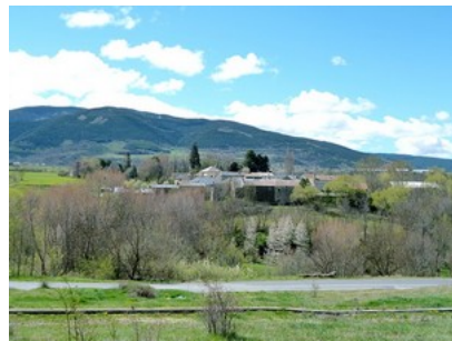
General view of Rô