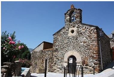
Sainte Eugénie of Védrygnans church