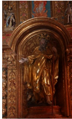
Sant Antoni del Porquet altarpiece (Saint Anthony)