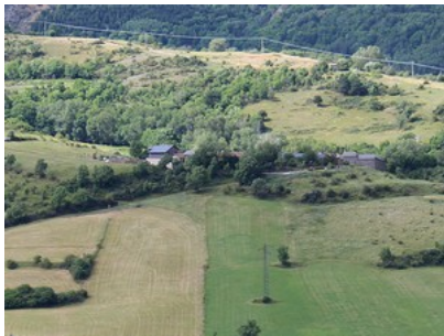
General view of Vedrignans from Cami de Mirabo