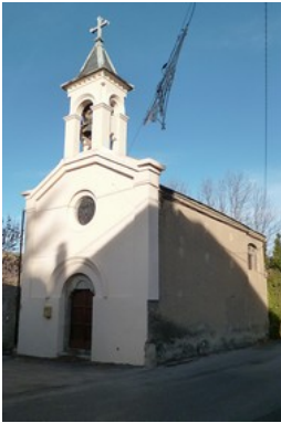
Saint Antoine de Rô church before and after the painting of the facade in 2015