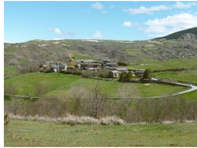
General view of Vedrignans. On the right, in the background, the village of Llo.