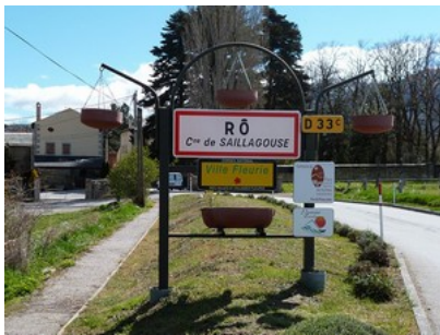
Entrance of Rô