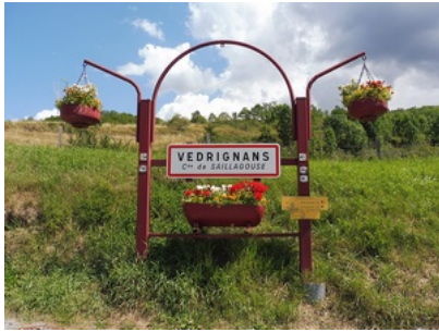
Entrance of Vedrignans