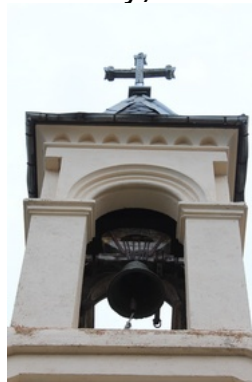
Bell tower detail