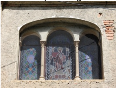
Detail of the stained glass windows of the church of Rô - View from the outside