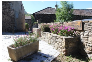
Fountain near Cami de Vedrinyans