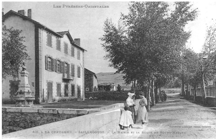
The town hall