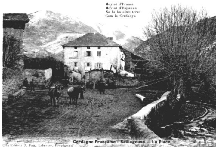
Place del Roser